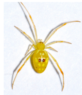
9 Cob-web Spiders Spintharus sp. THERIDIIDAE