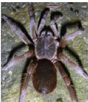
7 Tarantula MYGALOMORPHAE