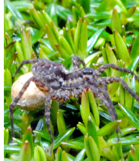
2 Wolf Spider LYCOSIDAE