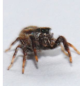
3 Jumping Spider SALTICIDAE 2 morpho-species