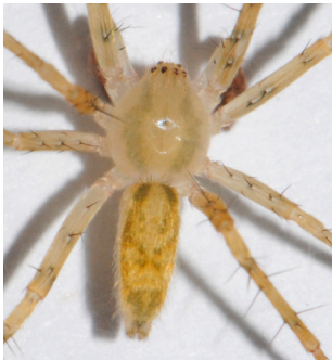
4 Ghost Spiders ANYPHAENIDAE 2 morpho-species