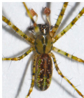
8 Long-jawed Spiders TETRAGNATHIDAE