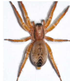
5 Sac Spider CLUBIONIDAE