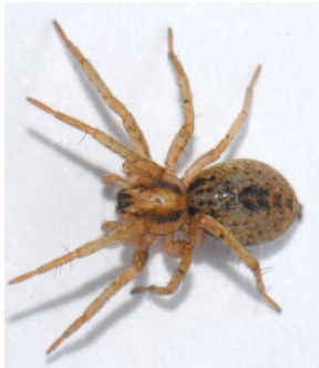
1 Sac Spider CLUBIONIDAE